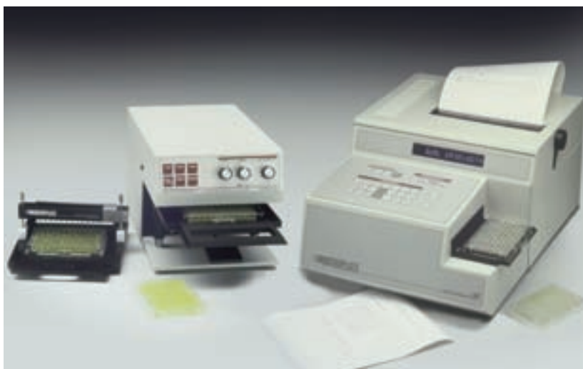
Figure 2 (above) EL402 and EL310 microplate instruments from BioTek Instruments, circa 1984

In this decade, other scientific advances and new technologies have led to new uses of microplates. For example, the development of RNAi technology has led to genomic screening efforts on a scale similar to HTS. The old HTS paradigm of screening large libraries of small molecules against purified proteins has been replaced, in large part, with assays of greater biological relevance using cells where the drug target is in a milieu more representative of what would occur in the human body. This has driven the need for specialty microplates for cell usage, liquid handling devices that can dispense and wash cells and microplate readers that can measure optical readouts from the bottom of the microplate well. In addition, many researchers want more information per well through multiplexing efforts. A number of technologies have been developed to achieve this including Luminex Corporation's xMAP technology that can measure up to 100 different analytes per well