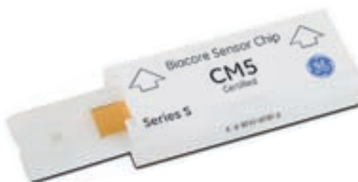
Figure 5 Biacore CMS5 sensorchips.

Label-free technologies based on surface plasmon resonance (SPR, Figure 5) such as that offered by Biacore (now part of GE Healthcare) do not use a microplate format and compete on an effective basis with microplate-based technologies performing immunoassays for applications such as biotherapeutics drug discovery and development. Compared to small molecule drug discovery, biotherapeutics have had numerous successes in the pharmaceutical market, especially for immunotherapeutics. Currently there are about 100 companies developing more than 190 antibody drugs for more than 40 different cancer