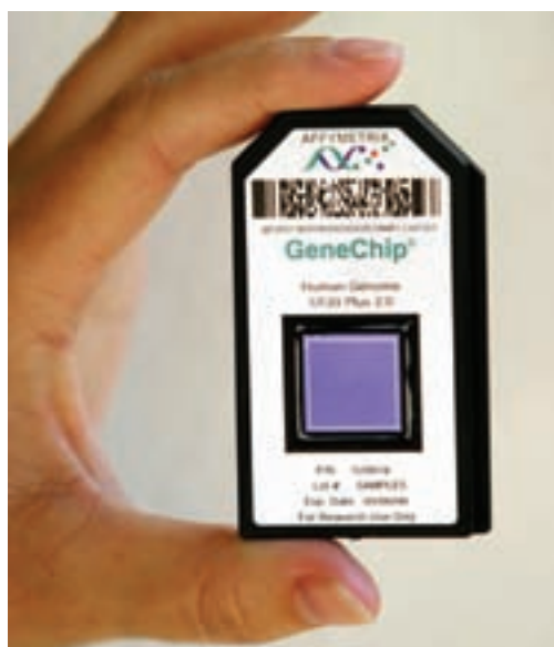
Figure 3 (right) Human Genome U133 Plus 2.0 array.