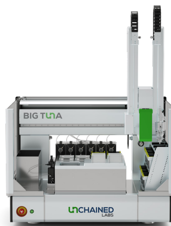
Figure 1: Big Tuna automates buffer exchange.

Buffer exchange with Big Tuna is highly customizable and adaptable, allowing for buffer exchange of up to 96 unique proteins and formulations in a single experiment. Unchained Labs developed two filter plate formats for this process. The Unfilter 96 and 24 are 10 kDa molecular weight cut-off (MWCO) filtration plates which are designed to withstand 60 psi pressurization during the buffer exchange process (Figure 2).